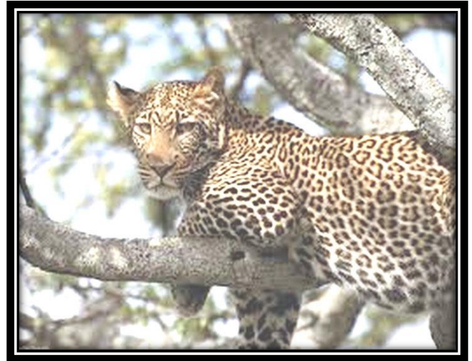
( Panthera pardus pardus )

When you hunt leopards in Namibia, several baits are put out at least a month in advance of the hunt to ensure that we have at least two males on bait when the hunter arrives. These baits are put out in a huge area and many times two males are on bait when the hunter arrives. Trail cameras are also put at each bait to check to see which leopards are feeding and to help to determine the size and sex. The client has a guarantee at shooting his leopard in Namibia. Success rate is 100% in the past ten years. The outfitter and guides take Saturdays off to work on equipment and process hides; however, the lodge is still open on those days. You will not be charged for Saturdays. Lodge staff works all day Saturdays cooking, serving guests and cleaning.